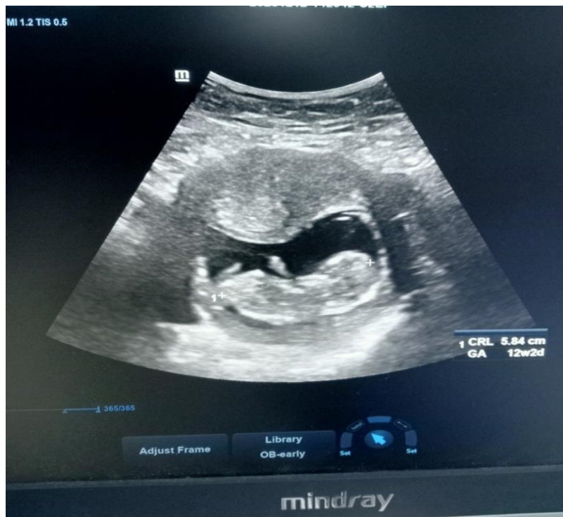
Figure 3: First-trimester ultrasound at 12 weeks gestation age.